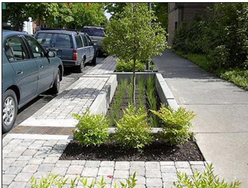
Figure A-4. Infiltration Planter