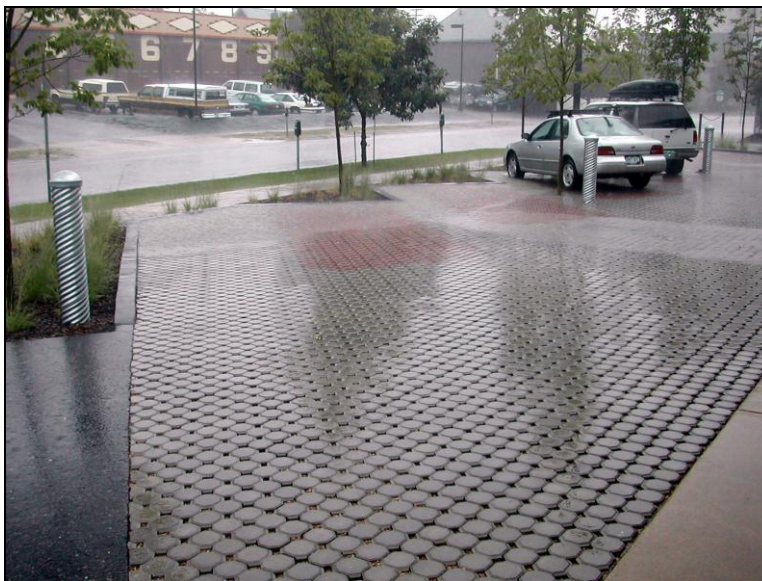
Figure A-5. Permeable Pavement