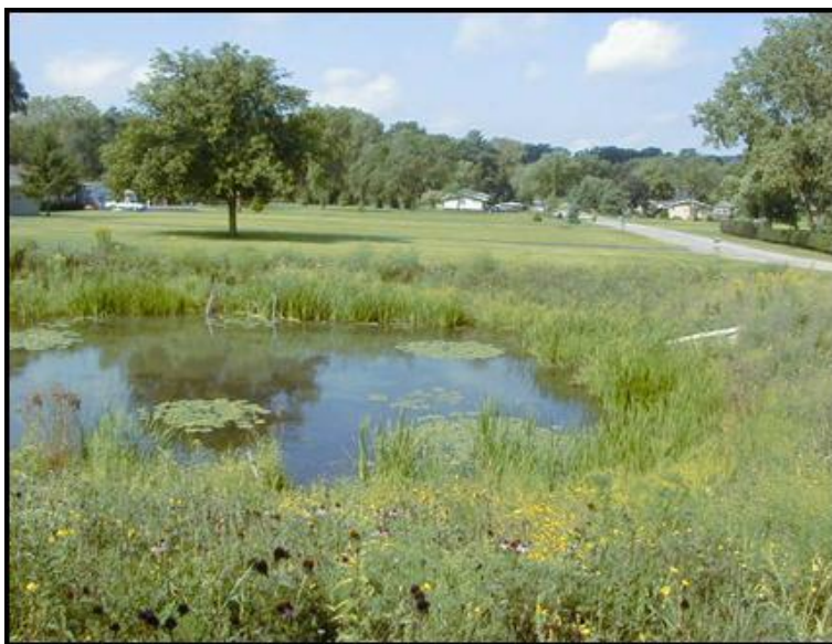
Figure A-6. Constructed Wetland for Stormwater Management