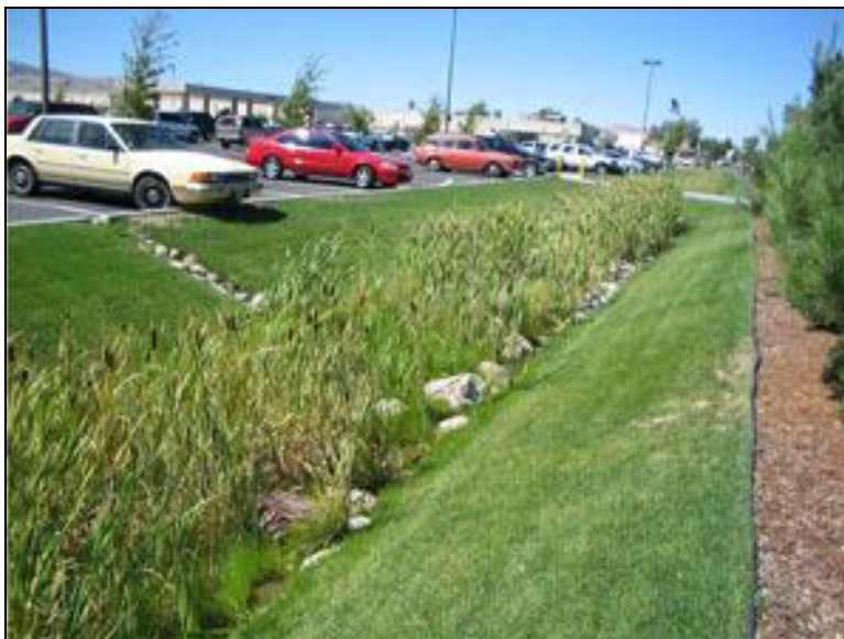
Figure A-3. Vegetated Swale