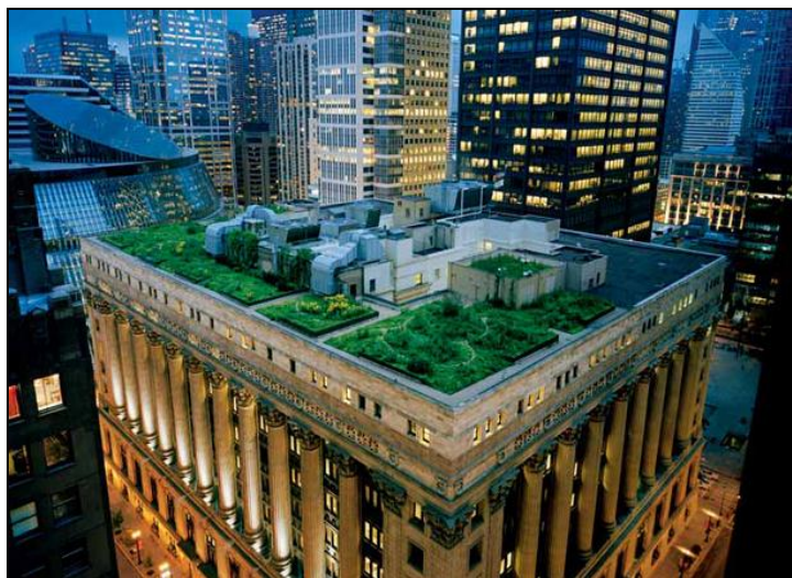
Figure A-1. Green Roof in Chicago