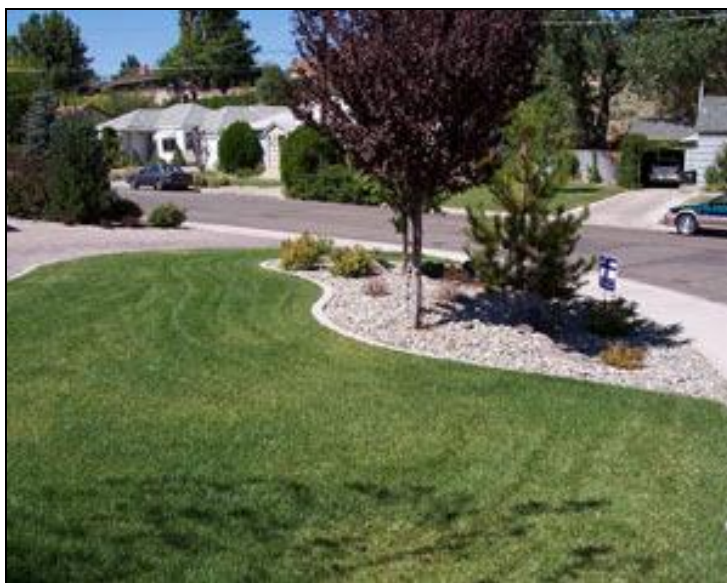
Figure A-2. Rain Garden